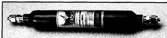
High Capacity Moisture Trap

For more information on Restek traps, please see pages 350-351.